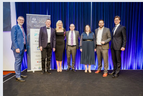
M3 Property Valuation Team the Year