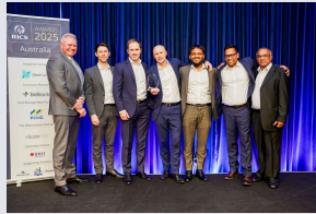
Turner & Townsend Quantity Surveying Team of the Year