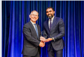
Sydney Water - Upper South Creek Advanced Water Recycling Centre Project of the Year