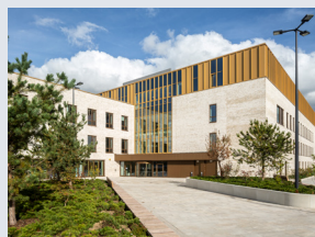
Parkhead Health, Social Care and Community Hub, Glasgow Public Sector National Winner 2025