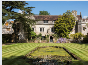
Athelhampton Zero, Dorset Environmental Impact National Winner 2024