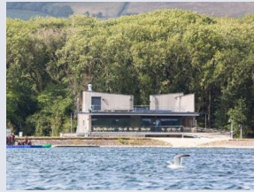
Lisvane & Llanishen Reservoirs, Cardiff Land Management and Sustainable Development National Winner 2024