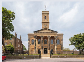
Sheerness Dockyard Church National Project of the Year 2024