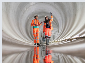
Thames Tideway Tunnel, London Infrastructure National Winner 2025