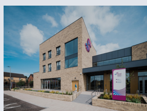
Shankill Shared Women's Centre, Belfast Community Benefit National Winner 2025