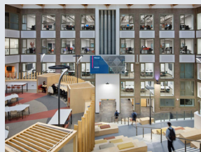
Stephenson Building, Newcastle University National Project of the Year 2025