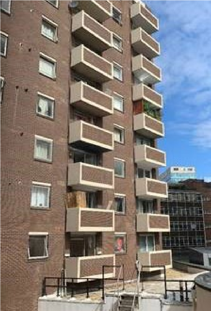
Figure 3: Case study 3