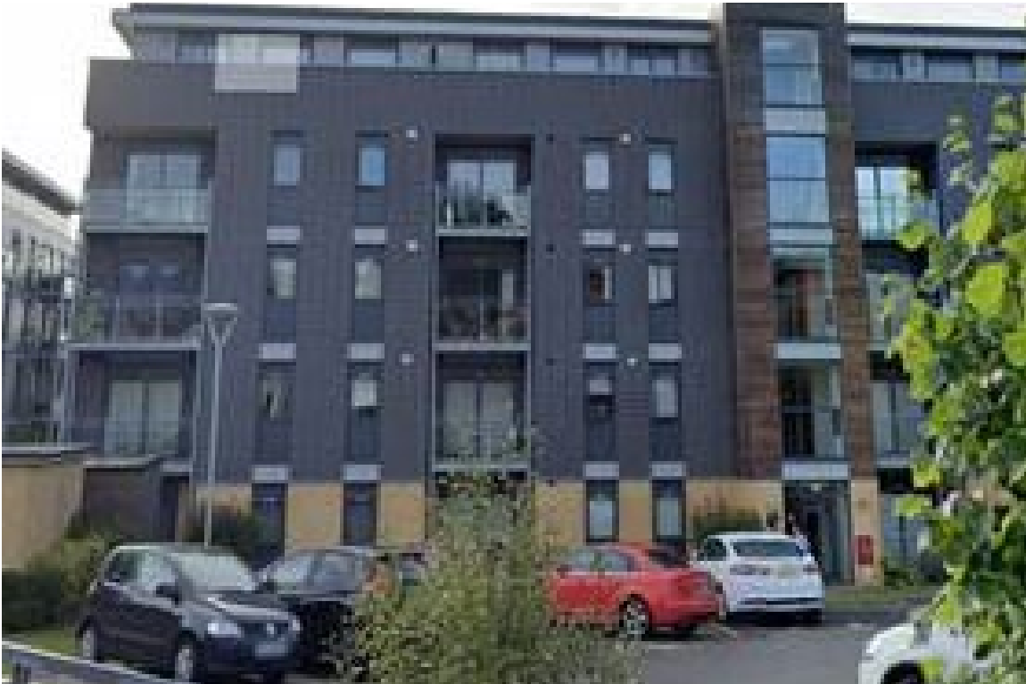
Figure 6: Case study 6