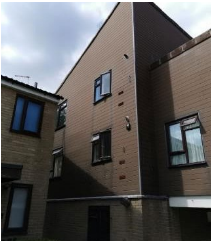
Figure 9: Case study 9