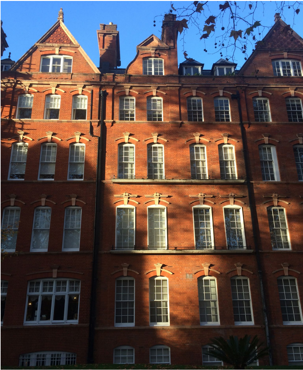
Figure 5: Case study 5