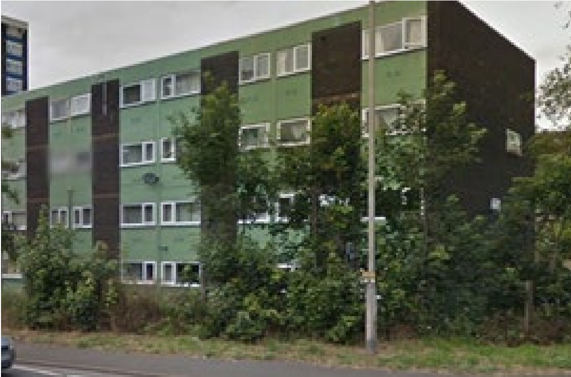
Figure 8: Case study 8