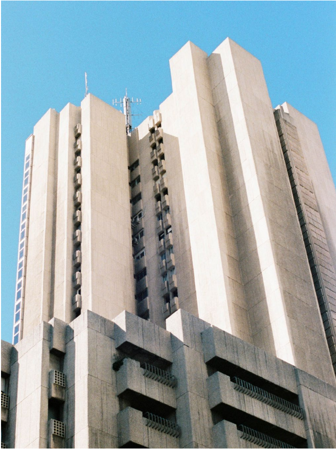
Figure 2: Case study 2