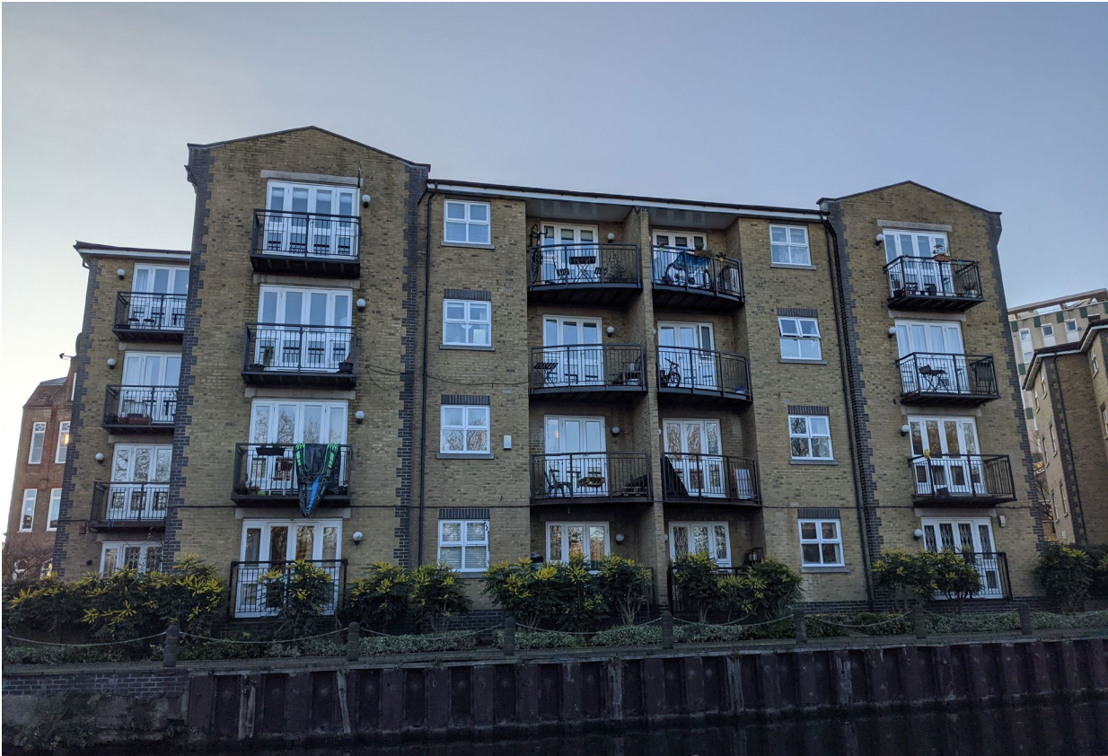
Figure 7: Case study 7