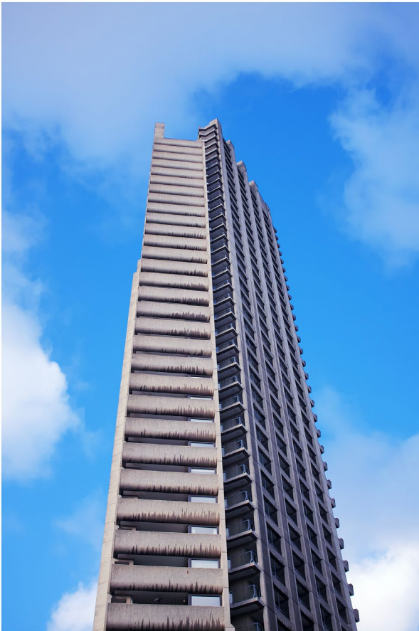
Figure 1: Case study 1