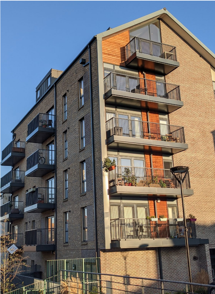
Figure 4: Case study 4